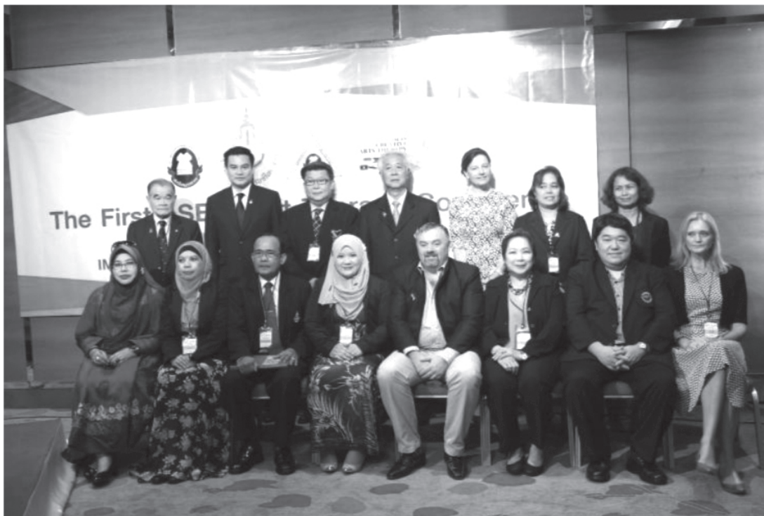
Figure 2. Presenters' group picture.