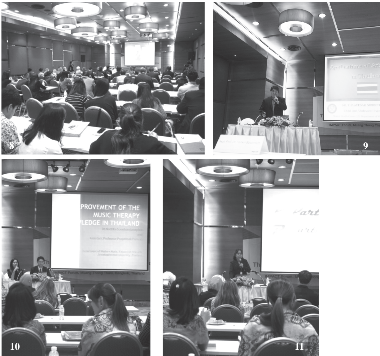
Figure 8. The Conference atmosphere