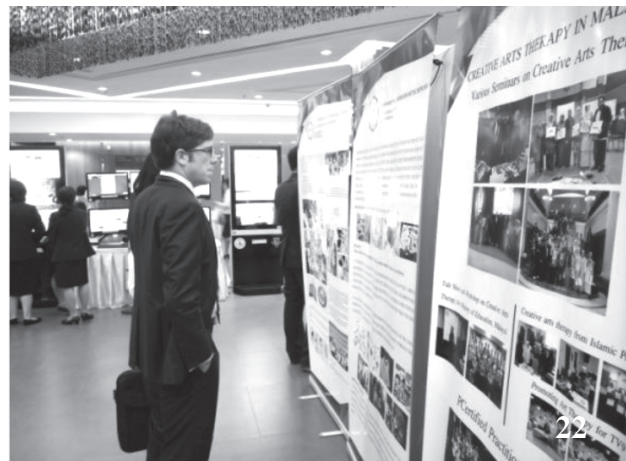
Figures 19-22. Exhibition booths displaying art therapy research works and activities.

fessional practice in Southeast-Asia. Various aspects of art therapy and related professions were encountered for the first time. The members have exchanged their knowledge and experiences. All agreed to the establishment of ASEAN of the Art Therapy association. They expect that the networking would encour-