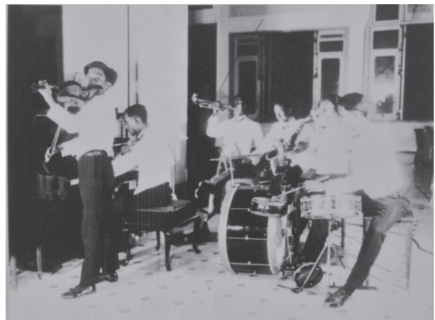
Figure 3 The Rainbow was playing at Phayathai Hotel

The reign of King Rama VII was the joint of many changes such as the change in regime, the entertainment culture which changed accordingly to the society, and the governmental policy which encouraged people to be of the international standard, an issue which would be mentioned in the following topic.