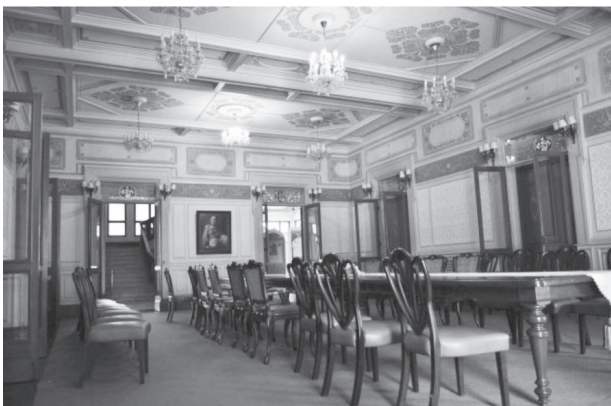
Figure 4 The ground floor of Wiman Chakri Palace which was used as the dining space with musical ensemble played at the floor outside.