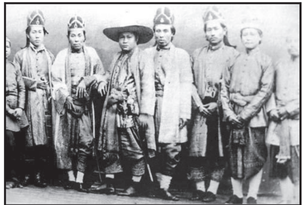
Figure 1 The group of diplomats during the reign of King Rama IV who brought the royal letter and royal tribute to Queen Victoria.