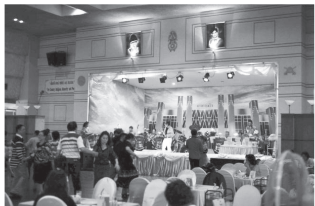
Figure 5 People are dancing inside the restaurant which is in the Bangpoo Resort.

After the regime change, Field Marshal Plaek Phibunsongkhram became the prime minister in 1935. The government under his authority launched state convention policy. This policy encouraged people to adapt their social value to match with Western one such as dressing, listening to Western music, having government officers go to ballroom parties in the weekend and participate in ballroom dance which was named "Lilad" in Thai language. Moreover, the government encouraged the Royal Thai Army Band to create a big band as an official support to ballroom dance. There was also the establishment of Wong Dontri Lilad Krom Khosanakan. This ensemble, which had a mission to disseminate the governmental news and support governmental entertainment activities, played Western music and broadcasted through the radio one or two times a day. After that, there were many Western musical ensembles created such as the Royal Thai Army's Duriyayothin Band, Krom Khosanakan Lilad Ensemble, Suntharapon Band, Tor Ngek-Chuan's Yus Band, and Khitasewi Band. These bands alternately played in ballroom