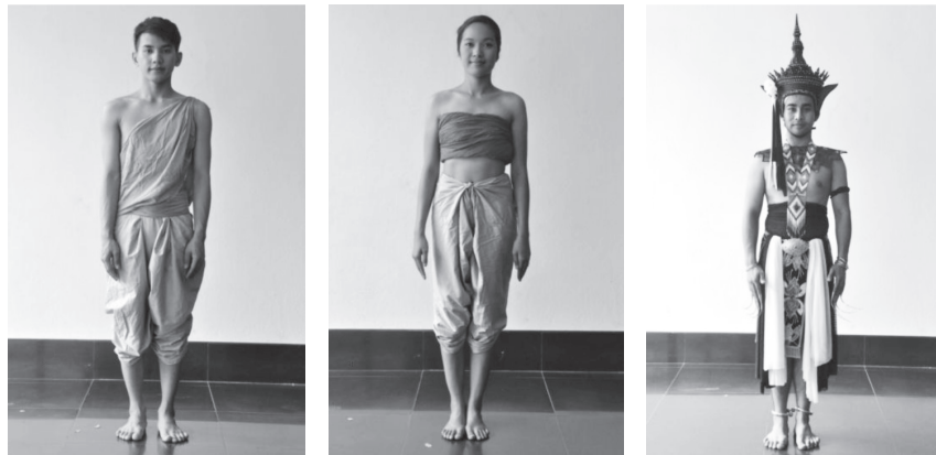
Figure 3 The costume design for the Nora characters.