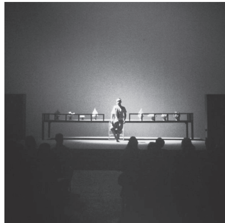
Figure 1 Life after Death of Nora Ancestor show at SEAPA 2013.

For this study, the researcher applied the concept of choreography that reflected the belief in life after death of the Nora ancestor. The research included data from the real people who was related to the Nora ancestor in their after death and other documents, the theories on esthetics, the theories on creativities and the contemporary choreography creation of Naraphong Charassri. By including the concept, theories, and other related researches to support the researcher's study that would reflect the creation of choreography that reflected the belief in life after death of the Nora ancestor. This was because there were no prior works done that would reflect the be-