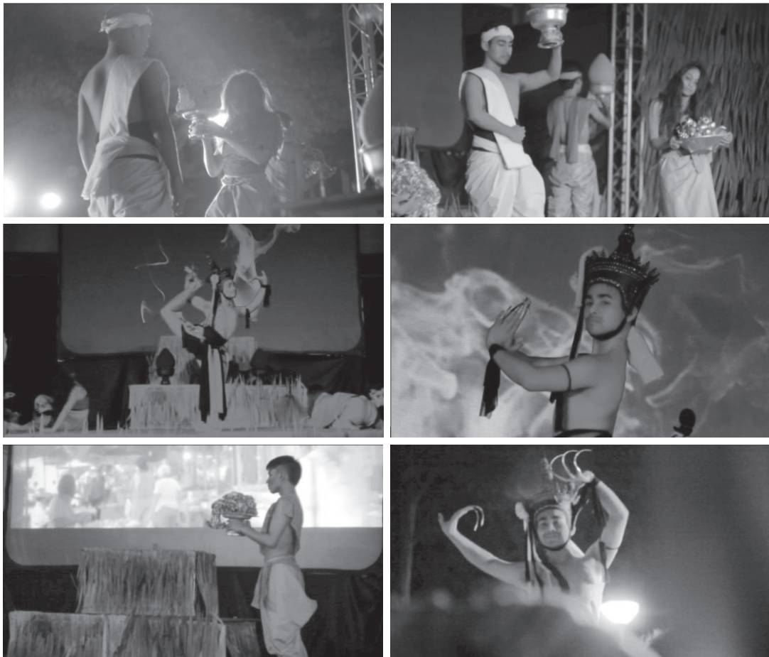
Figure 4 The Final Show of “Life after Death of Nora Ancestor”.

1) Arrange for creativities so that there would be the conservation of culture.