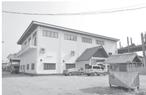
Figures 1 and 2 Teaching and Learning buildings.