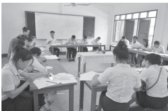
Figures 3 and 4 Painting and Drawing classrooms.