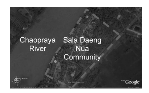
Figure 1 Location of Baan Sala Daeng Nua

Planning of Tourists Lodging Places at Baan Sala Daeng Nua" to be a roadmap for development and to be beneficial to Baan Sala Daeng Nua going forward.