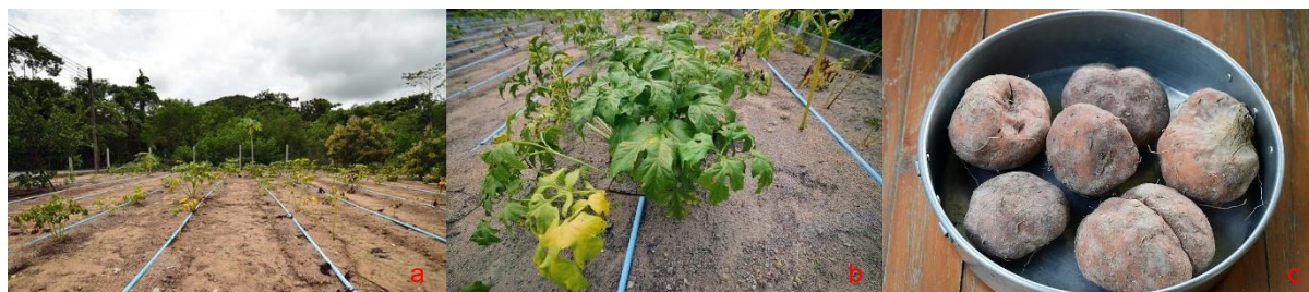
Figure 1. Thao Yai Mom ( T. leontopetaloides (L.) Kuntze) plants (a-b) and tubers (c), cultivated at Pornudom herbal garden, Sattahip District, Chonburi Province, and fresh tubers.

The fresh tubers of Thao Yai Mom ( T. leontopetaloides (L.) Kuntze) were collected from Pornudom herbal garden in Sattahip district, Chonburi province, Thailand (Figure 1). The tubers were cleaned, peeled and sliced. Fleshes and peels were sun-dried for two days and then ground into fine particles (37 \mu m) separately. The extracts were prepared following the scheme shown in Figure 2.